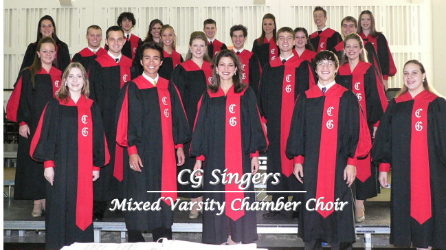
CG Singers Mixed Varsity Chamber Choir