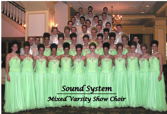
Sound System Mixed Varsity Show Choir

Thank you for believing in the young people of our community, and for your financial support. Both are essential to the continuation of the Center Grove competition choirs, and to exceptional achievement by its students.