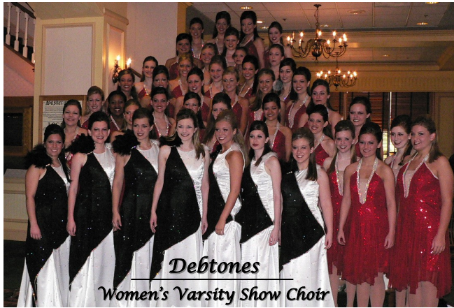
Debtone Women's Varsity Show Choir