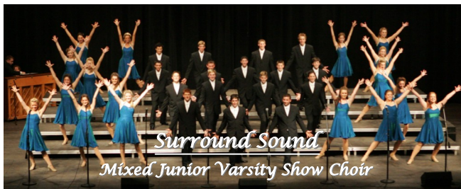
Surround Sound Mixed Junior Varsity Show Choir